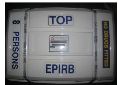
Life Raft Packed in Flat Container for 4 - 10 Person