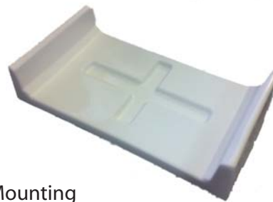
Chocks for Deck Mounting For Flat Containers Only (4 - 10 Person) Measurements: 54cm x 30cm x 11.5cm