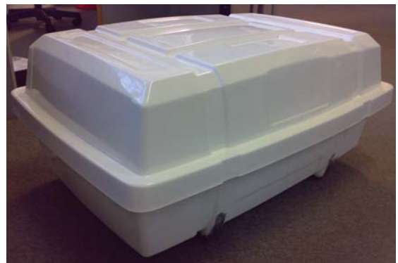
Side views of Container for 4 - 10 Person