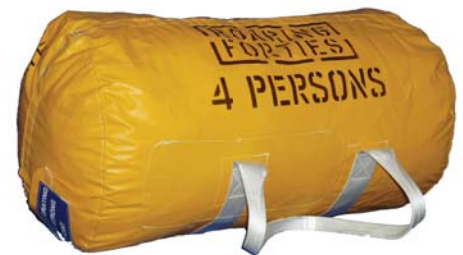
Life Raft Packed in Valise

ROARING FORTIES™ ISO 9650 Type 1 Group A life rafts are manufactured by SAFETY MARINE AUSTRALIA Pty Ltd in Australia.