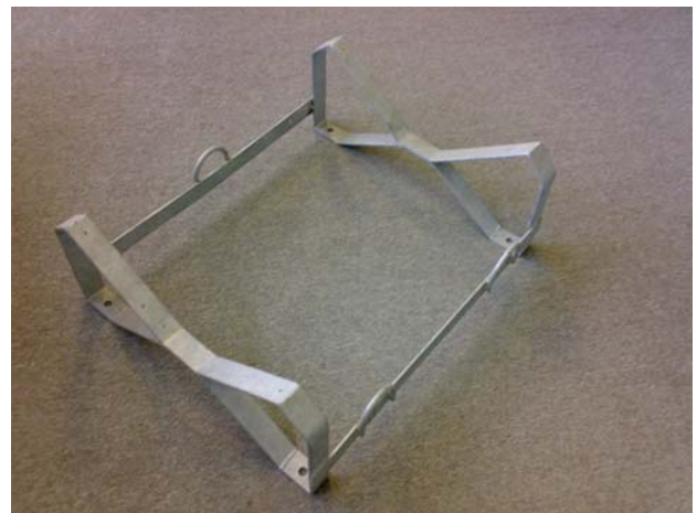
Cradles for Deck Mounting For Round Containers Only (12 - 25 Person) Measurements: 66cm x 55cm x 25.5cm