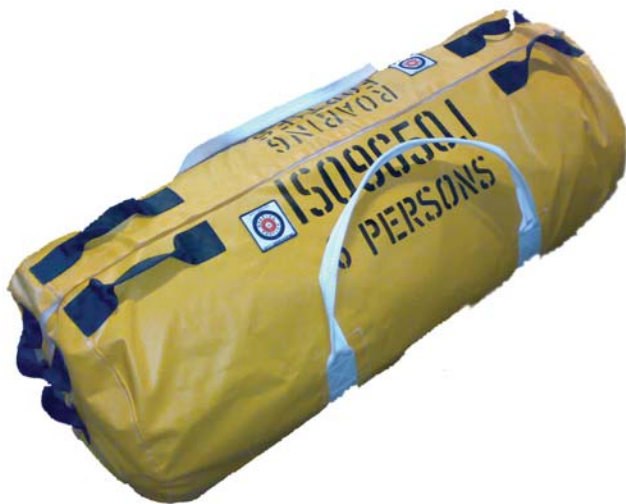
ISO9650 Type 1 Life Raft packed in Valise

*Measurements for valises are only an approximate guide, subject to equipment contents and life rafts with thermal insulated floor*